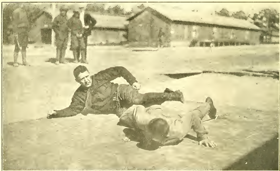
No. 4—THE GO BEHIND

Photos No. 1 and 2 show the aggressor in the act of throwing his body forward, the throw is similar to that of a man sliding for a base.