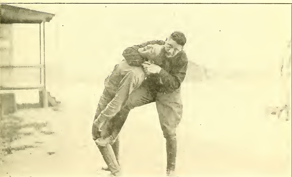
No. 10—BACK STRANGLE

Note: —A strangle hold always means the placing of one forearm across the front of your opponent's neck. This should be strengthened by use of the other arm. The aggressor's forearm is pressed against the neck and the thumb driven into the "Adam's apple." Complete strangulation is only a matter of time. It takes a strangle hold but a few seconds to render a man absolutely incapable of effective resistance.