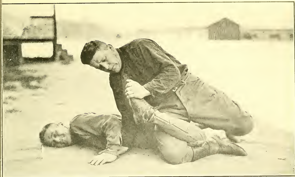
No. 19—FOLLOW UP FROM No. 18

When the defensive man is brought to the ground the attacker steps over with his right leg and straddles and sits on the near leg of the defensive man above the knee, grasps the foot and raises up over the attacker's leg. This plunges the head of the defensive man forward on his face. The imprisoned leg should be drawn up as high as possible to give the longest leverage, in which position it is possible to break the leg.