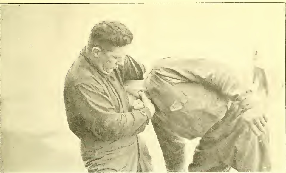
No. 9—FRONT STRANGLE

Grab the head, bringing it forward and down; drive knee into jaw and apply full strangle hold, driving thumb into "Adam's apple." After securing strangle hold, drop opponent to ground immediately so as to prohibit him from obtaining any other hold on you.