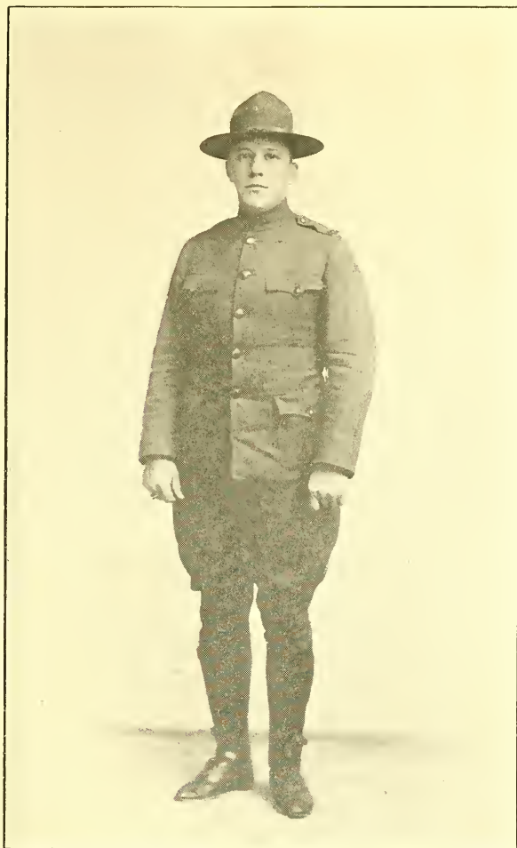
BILLY C. SANDOW Physical Culture Expert; Instructor U. S. Army Manager and Trainer of Ed "Strangler" Lewis