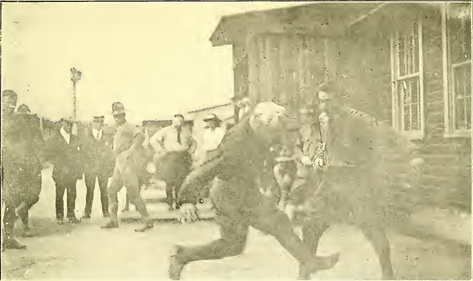
No. 1—THE GO BEHIND