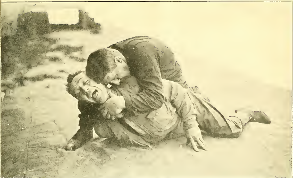
No. 27—STRANGLE AND HEAD BUTT FROM THE REAR, ON THE GROUND

After throwing your opponent to the ground with the go behind, force his head back with strangle hold, at the same time butting opponent with your head. By applying full pressure on strangle hold it is impossible for an opponent to break away.