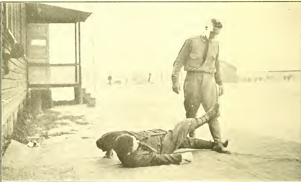
No. 8—THE GO BEHIND

The opponent is held with your leg. The aggressor raises the left foot and plants it in the opponent's knee. This method is effective and will throw the opponent to the ground.