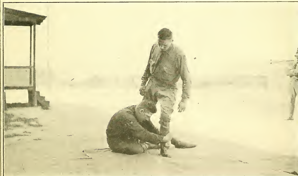
No. 6—THE GO BEHIND

Illustrates correct position of go behind. When the aggressor strikes the opponent's ankle he destroys the opponent's equilibrium, so this clever throw will send your opponent sprawling.