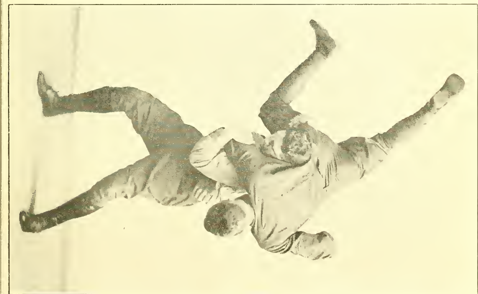
No. 13—ARM AND LEG HOLD

In obtaining this hold, both movements are secured at the same time. To secure the leg hold, strike down, forcing arm through crotch, then continue, the arm following through to obtain hold. With the other hand grasp the opponent's near arm at wrist to secure leverage, your head passing under his arm pit. The opponent is then in position to be thrown over shoulder by raising body up quickly, using neck and back as main leverage points. The whole movement must be executed rapidly to be effective.