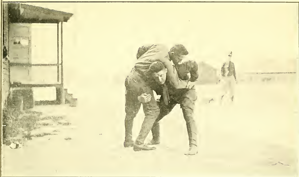
No. 12—ARM AND LEG HOLD

In obtaining this hold, both movements are secured at the same time. To secure the leg hold, strike down, forcing arm through crotch, then continue, the arm following through to obtain hold. With the other hand grasp the opponent's near arm at wrist to secure leverage, your head passing under his arm pit. The opponent is then in position to be thrown over shoulder by raising body up quickly, using neck and back as main leverage points. The whole movement must be executed rapidly to be effective.