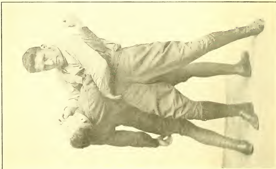
No. 22—FOLLOW UP FROM No. 21

When first coming to a clinch it is quite natural for an opponent to reach in for a body hold. This affords an excellent opportunity for you to secure the wing lock. Slip your arm over and above the elbow of your opponent's extended arm and jerk him toward you, keeping his arm pinned to your side.