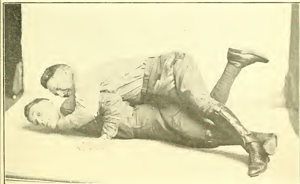
No. 20—TOE HOLD OVER THE LEG

When the defensive man is brought to the ground the attacker steps over with his right leg and straddles and sits on the near leg of the defensive man above the knee, grasps the foot and raises up over the attacker's leg. This plunges the head of the defensive man forward on his face. The imprisoned leg should be drawn up as high as possible to give the longest leverage, in which position it is possible to break the leg.