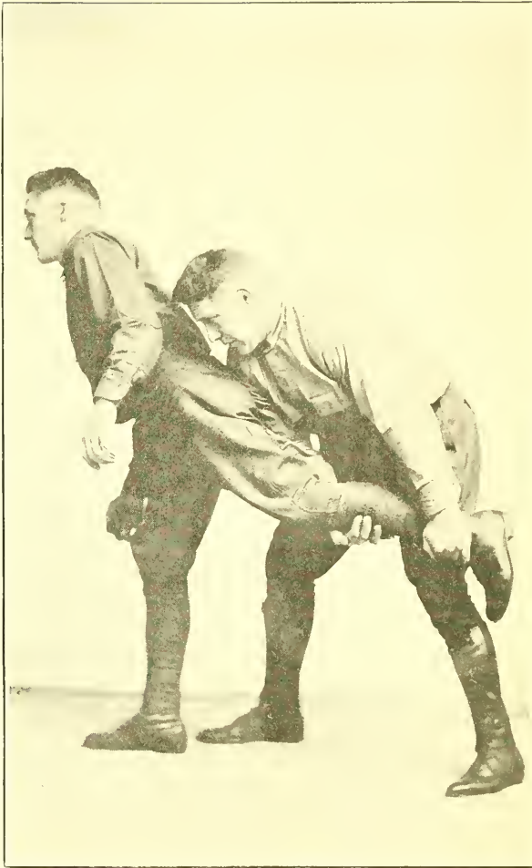
No. 18—ATTACKING LEG FROM REAR

Attack opponent from rear by grasping opponent's left ankle with your right hand, at the same time strike him with your right shoulder and raise the leg as high as possible, throwing opponent on his face.