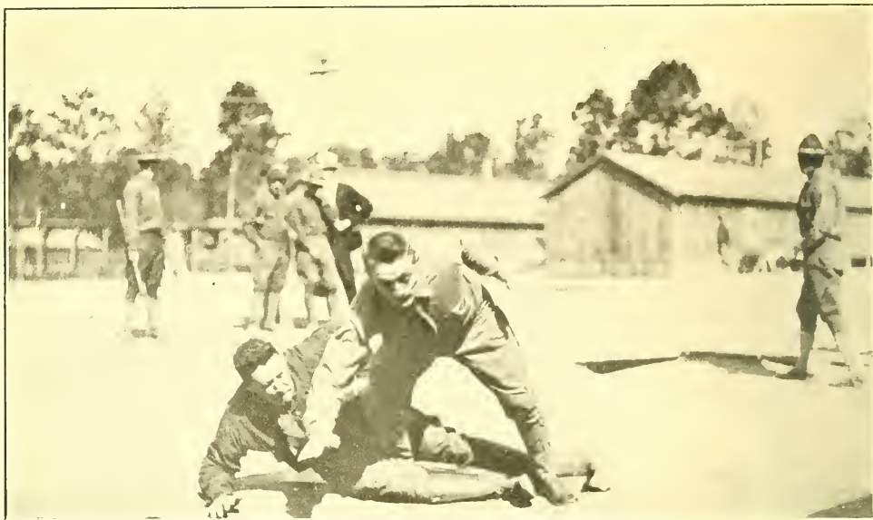
No. 3—THE GO BEHIND

Photos No. 1 and 2 show the aggressor in the act of throwing his body forward, the throw is similar to that of a man sliding for a base.