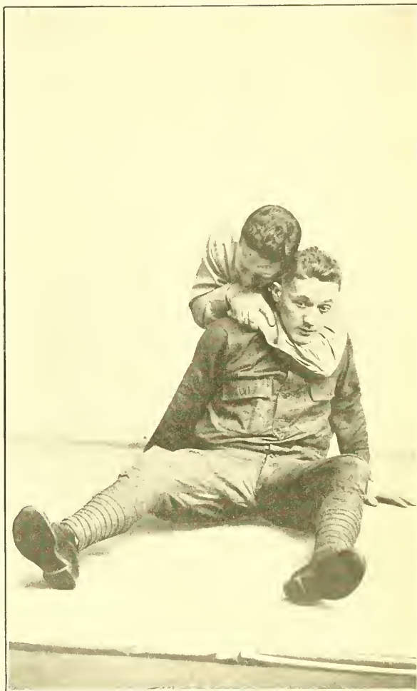
No. 11—BACK STRANGLE

Bring the left arm around your opponent's neck, the forearm is brought forcibly against the throat, now grasp the left wrist with the right hand, and pull your opponent backward.