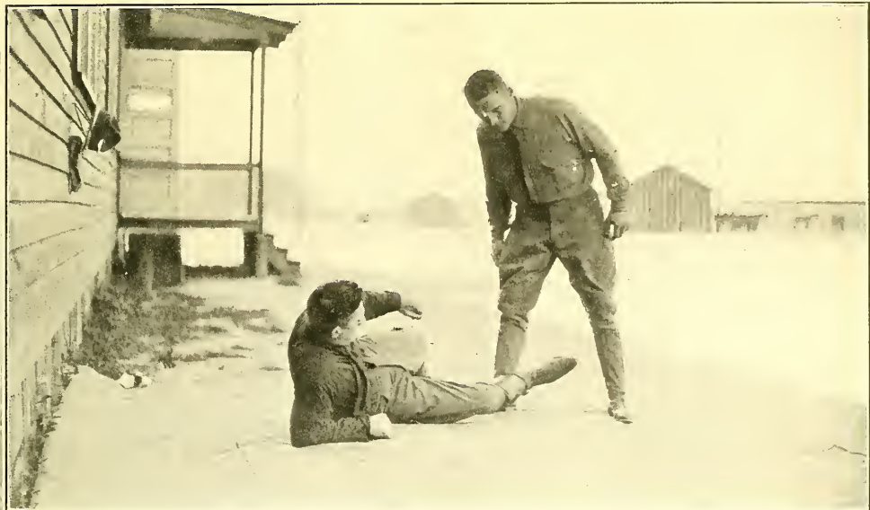
No. 5—THE GO BEHIND

Illustrates correct position of go behind. When the aggressor strikes the opponent's ankle he destroys the opponent's equilibrium, so this clever throw will send your opponent sprawling.