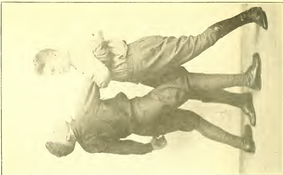
No. 21—THE WING LOCK

When first coming to a clinch it is quite natural for an opponent to reach in for a body hold. This affords an excellent opportunity for you to secure the wing lock. Slip your arm over and above the elbow of your opponent's extended arm and jerk him toward you, keeping his arm pinned to your side.