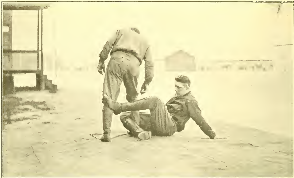
No. 7—THE GO BEHIND

The opponent is held with your leg. The aggressor raises the left foot and plants it in the opponent's knee. This method is effective and will throw the opponent to the ground.