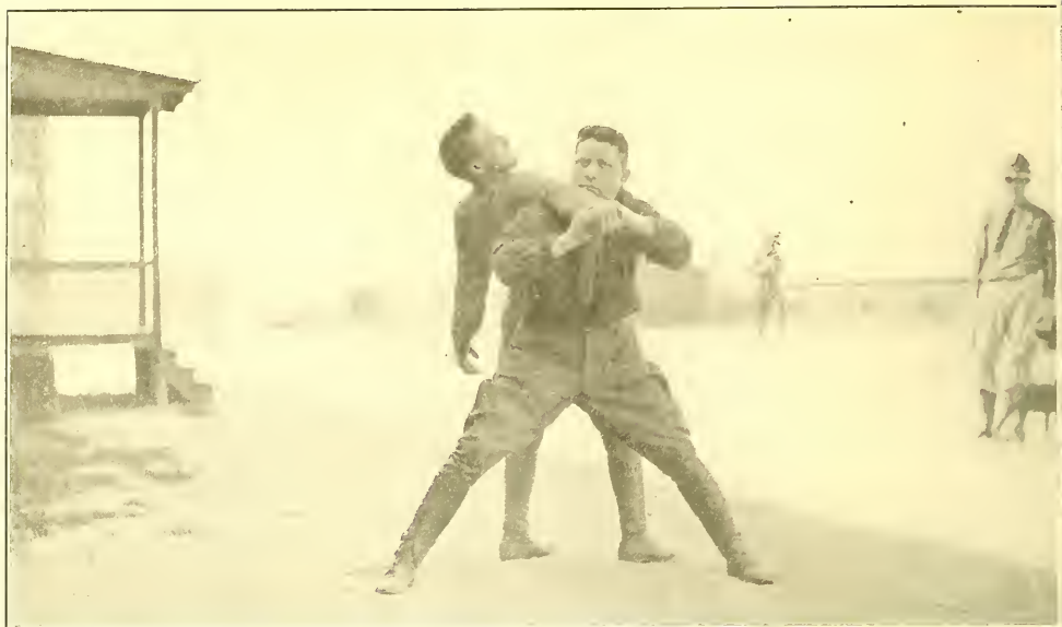
No. 14—FLYING MARE

Seize opponent's wrist with both hands, step in with back to your opponent, twist arm from you and draw it over shoulder. With arms as lever, bend forward quickly, giving your hips an upward twitch and pull forward on the imprisoned arm. The defensive man is plunged headlong over your shoulder.