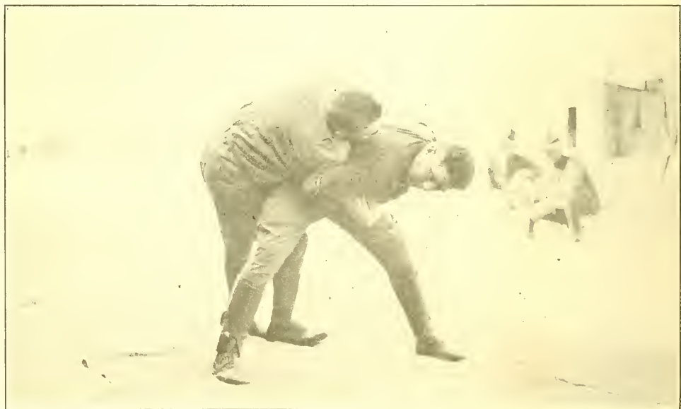
No. 15—BLOCK FOR WAIST LOCK FROM BEHIND

Seize opponent's wrist with both hands, step in with back to your opponent, twist arm from you and draw it over shoulder. With arms as lever, bend forward quickly, giving your hips an upward twitch and pull forward on the imprisoned arm. The defensive man is plunged headlong over your shoulder.